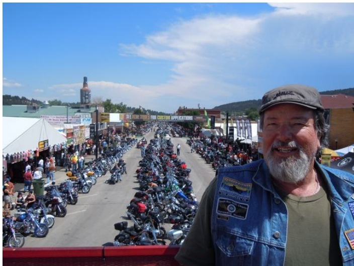
Main Street, Sturgis South Dakota

I rode across the Heartland of America on HWY 50, California to Maryland. Next I rode to Sturgis SD to accompany a friend on his ride home. And I went to Milwaukee to see the Harley Davidson Museum and ride the famous Route 66 from Chicago to California. I am on track for getting my 250,000 mile HOG patch after this Tax season.